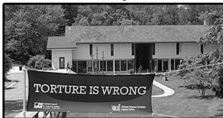
Northside Presbyterian/St Aidans

Thank you to all of the participating congregations