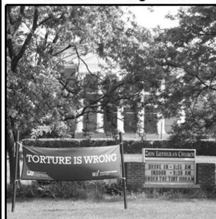
Zion Lutheran Church