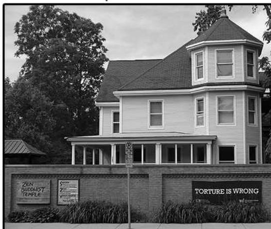
Zen Buddhist Temple