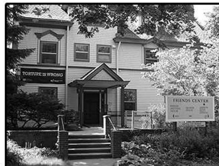
Friends Meeting Center