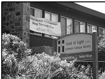
Lord Of Light

The ICPJ Iraq Next Steps Committee, with the National Religious Campaign Against Torture (NRCAT), has asked congregations of all sizes, and all faiths, to join in a public witness against torture by displaying a banner outside their place of worship during Torture Awareness Month June 2008. The campaign has seen success throughout the community with 12 participants helping to spread the message that torture is morally wrong and must be addressed.