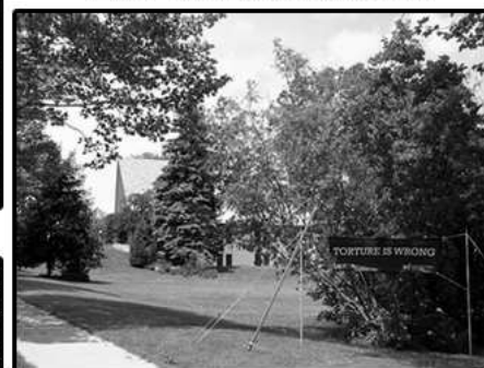
Northside Community Church