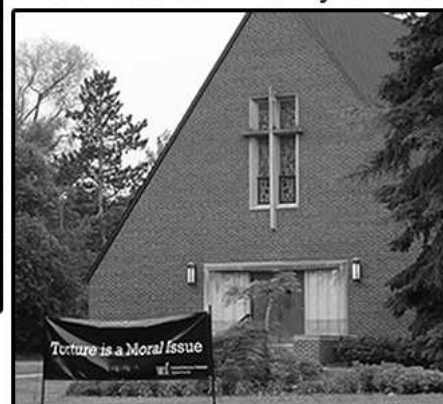
West Side United Methodist